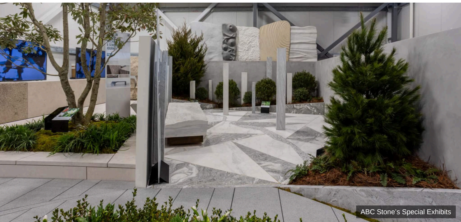
ABC Stone's Special Exhibits

August 27 & 28, 2025 The Frick Collection Gardens Tour