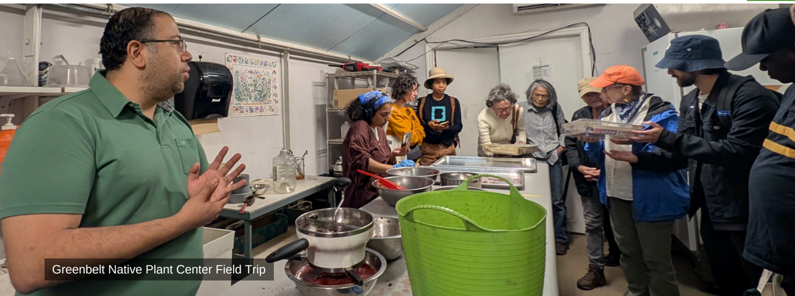
Greenbelt Native Plant Center Field Trip

May 8, 2025 Spring Social Meet up at Broadway Mall Association