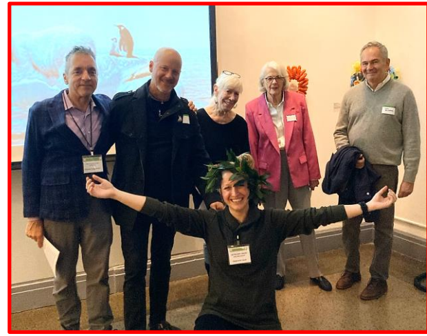
Current, past and future presidents of MHG.